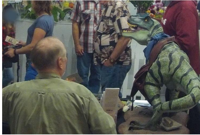
The author with Jessup at a county fair evangelism booth. Jessup is wearing a wild rag and custom saddlebags. Jessup hopes to become a Pony Express dinosaur when he grows up.

All images are either author photos, or a combination of author and Pixabay photos. Text and image editing by the author. All images are copyrighted by the author. All dinosaurs in this story live with the author and have not objected to having their stories told. All names used in this story are the real names of the dinosaurs.